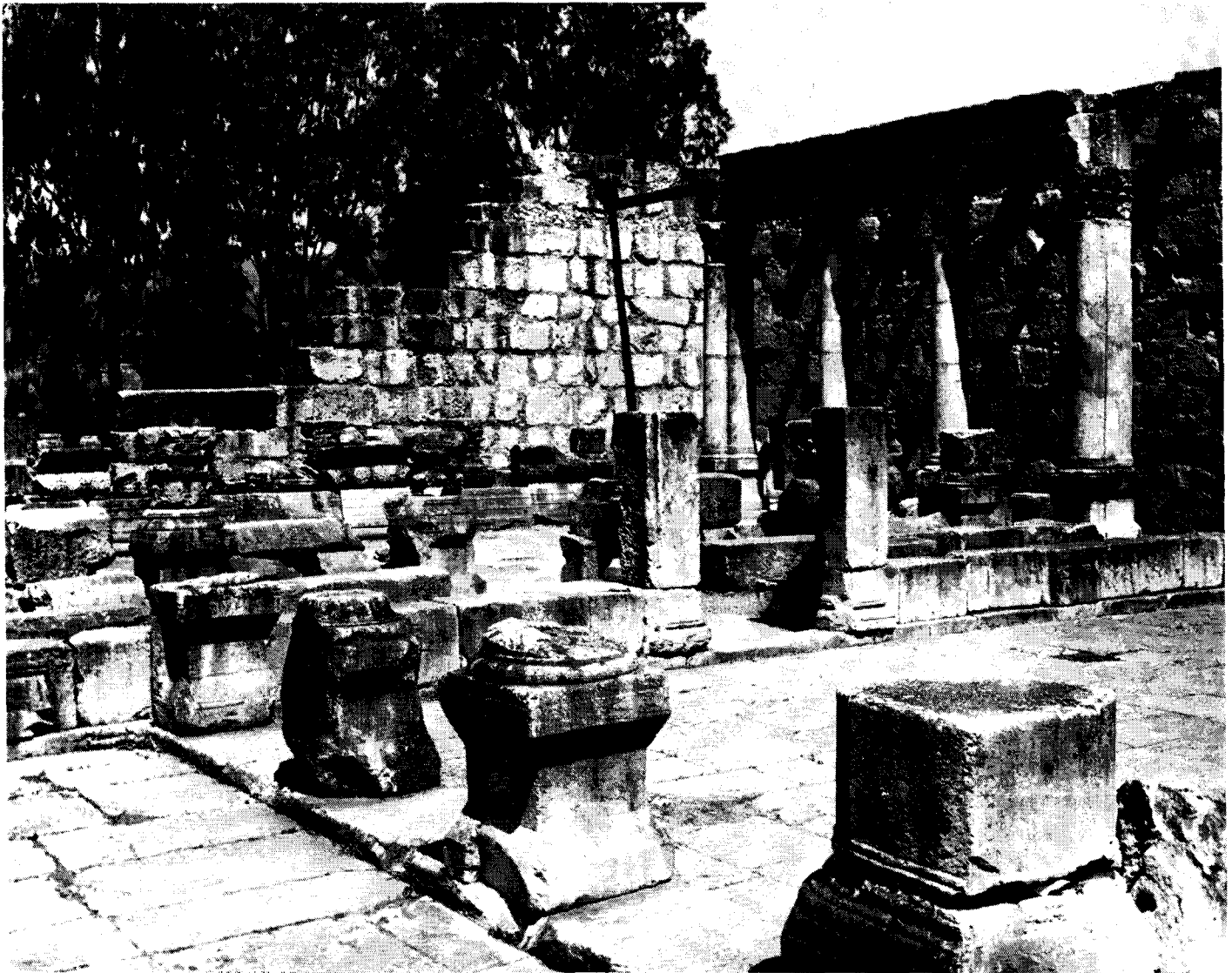
An inside view of the Capernaum synagogue. Though small, this was one of the largest synagogues in all Palestine.